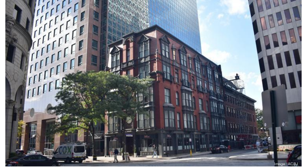
Beatrice Hotel, Providence, RI