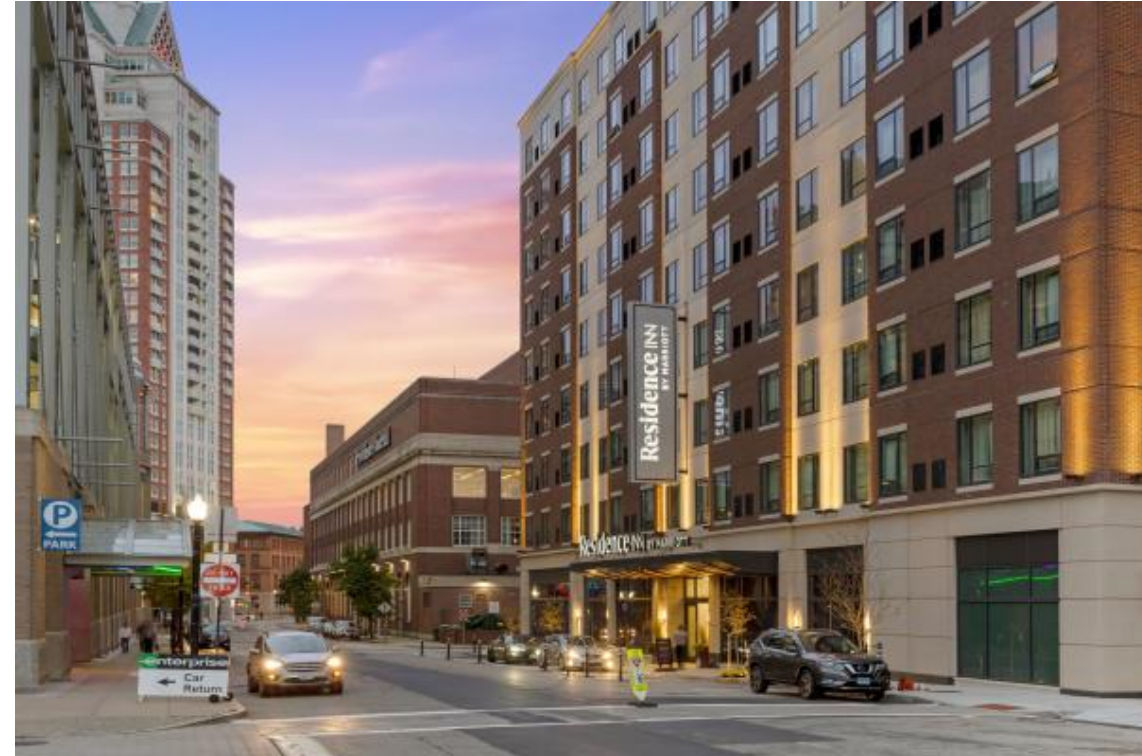
Residence Inn, Providence, RI