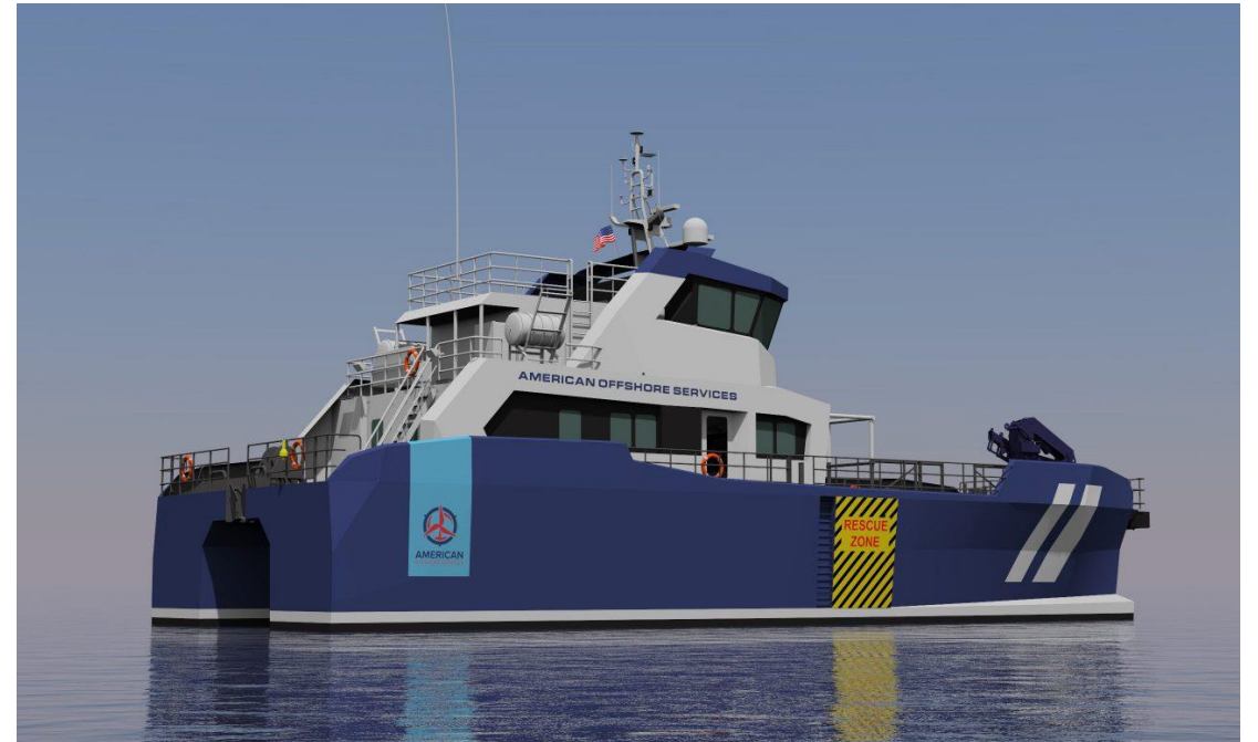
A-O-S (American Offshore Services), Providence, RI