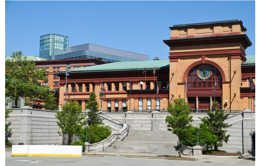
One Union Station Building, Providence, RI