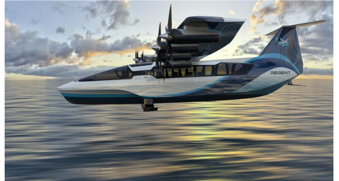
Regent Craft, North Kingstown, RI