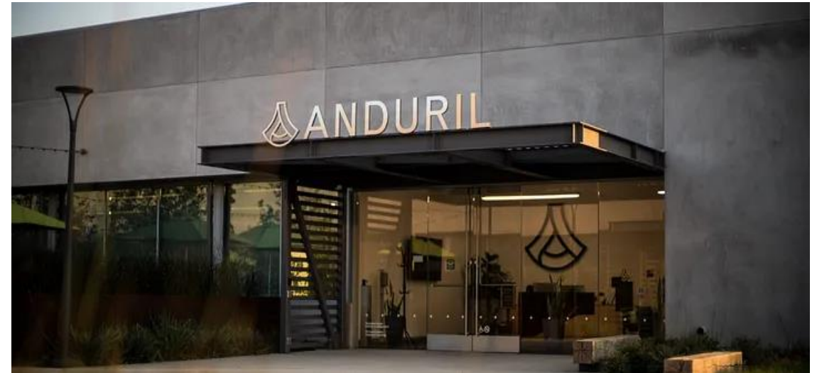
Anduril Industries, Irving, CA